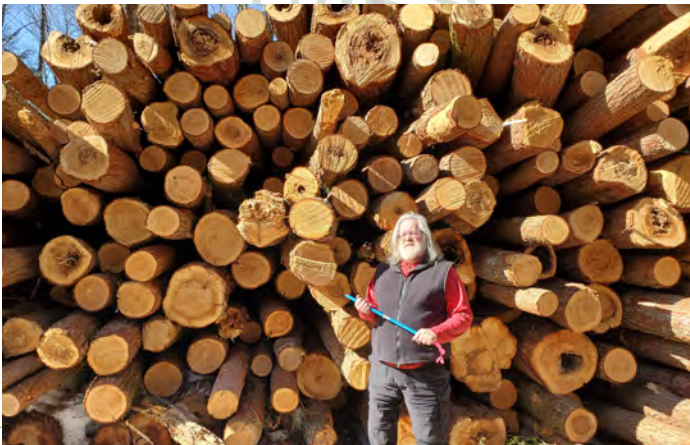
Image: from March 2021-AFER lead ecologist with harvested hemlock logs — hemlock is one of the least profitable of timbers.

The CFSC believes more logging will compromise the potential for the forest to reach an old growth state and the associated carbon sequestration, habitat, education and recreation values. While hemlock can grow to 600 years of age, logging will stunt this ability and likely encourage regrowth of more "profitable" timber species such as pine and hardwood. This is partly why old hemlock forests are so rare.