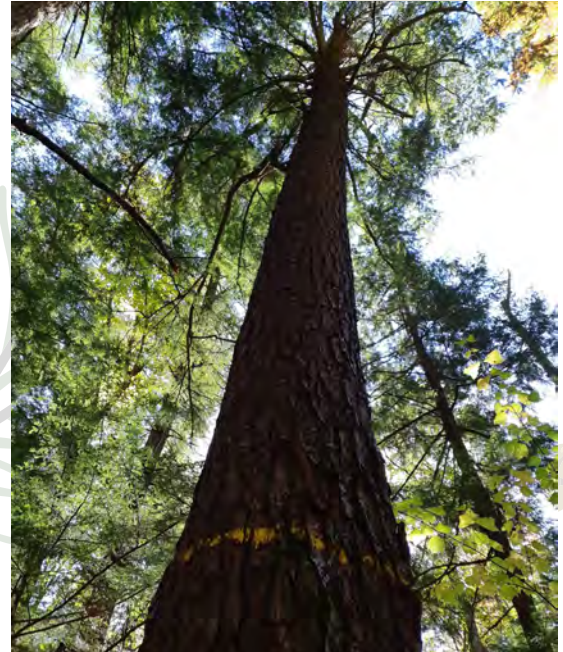
375 YEAR OLD EASTERN HEMLOCK TREE

Jesse and Lia also report that the Catchacoma Forest wetland complex supports Blanding's, painted and snapping turtles. Other species at risk include black ash,, Canada warbler, eastern wood pee-wee, eastern ribbon snake, five-lined skink, hog-nosed snake, rusty blackbird, wood thrush and pink dimple lichen.