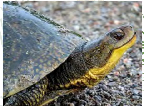
Blanding's turtle

Jesse and Lia also report that the Catchacoma Forest wetland complex supports Blanding's, painted and snapping turtles. Other species at risk include black ash,, Canada warbler, eastern wood pee-wee, eastern ribbon snake, five-lined skink, hog-nosed snake, rusty blackbird, wood thrush and pink dimple lichen.